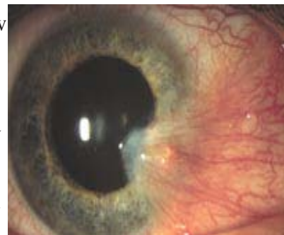
Pterygium of the eye

A pterygium is fleshy tissue that grows over the cornea (the clear front window of the eye). It may remain small or may grow large enough to interfere with vision. A pterygium most commonly occurs on the inner corner of the eye, but can appear on the outer corner as well. The exact cause is not well understood. Pterygium occurs more often in people who spend a great deal of time outdoors, especially in sunny climates. Long-term exposures to sunlight, especially ultraviolet (UV) rays, and chronic eye irritation from dry, dusty conditions seem to play an important causal role. A dry eye may also contribute to pterygium.